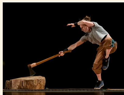
Left to right: Upswing Seasons; Ockham's Razor, PUBLIC; Circomedia, Volt.